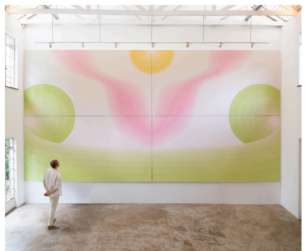
Abdus Salaam, And remember the day we shall roll up the universe like a scroll, 2024